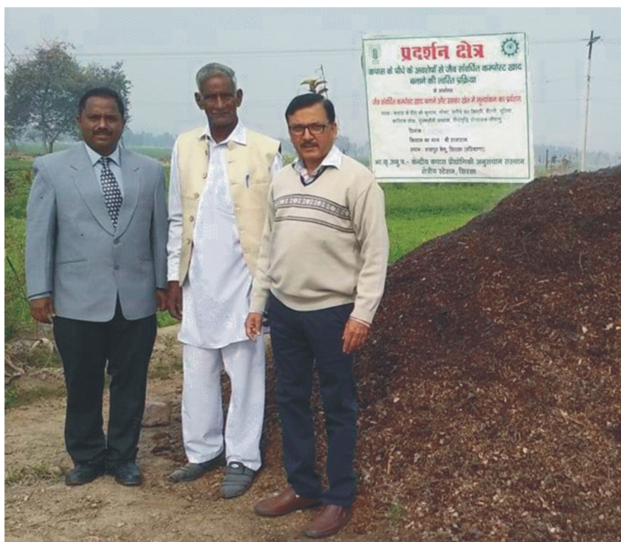
Fig. 1 Composting trial taken at farmers field at Begu Village, Sirsa, Haryana

were estimated different intervals (0, 3, 6, 9 and 12 months of storage). Irrespective of the storage period, the total bacterial population in the compost sample was higher followed by total actinomycetes and total fungi. The enumerated microbial count at 0, 3, 6, 9 and 12 months of storage is presented in Table 1. The total bacterial count (cfu/g) was found higher during the 0 th month of storage ( 2.6 \times 10^9 ) and declined to 3.0 \times 10^7 in 3 months and maintained 3.6 \times 10^8 after 6 months of storage of compost. The total fungal count did not much differ during 12 months of storage period. The total fungal count (cfu/g) was range between 1.5 \times 10^5 and 4.6 \times 10^5 . Similarly, the total actinomycetes population did not differ much during 12 months of storage period. The actinomycetes population (cfu/g) was